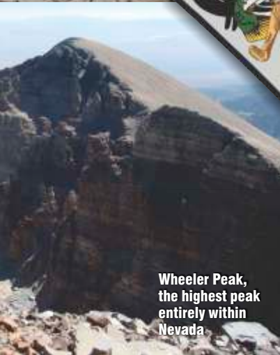
Wheeler Peak, the highest peak entirely within Nevada