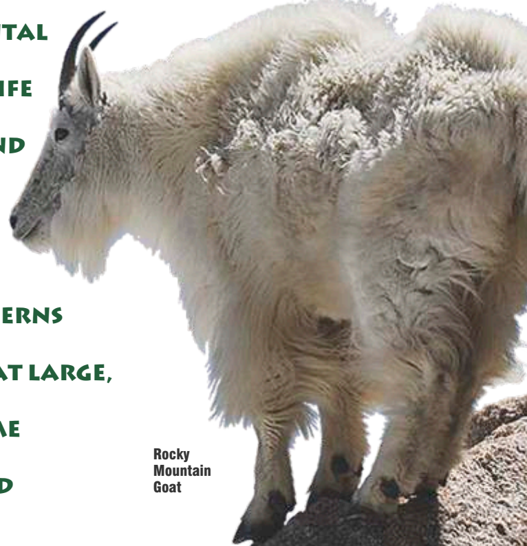
Rocky Mountain Goat

This year, we had one boating fatality on Nevada’s waters, a tragic loss of life, but one of the smallest numbers of fatal