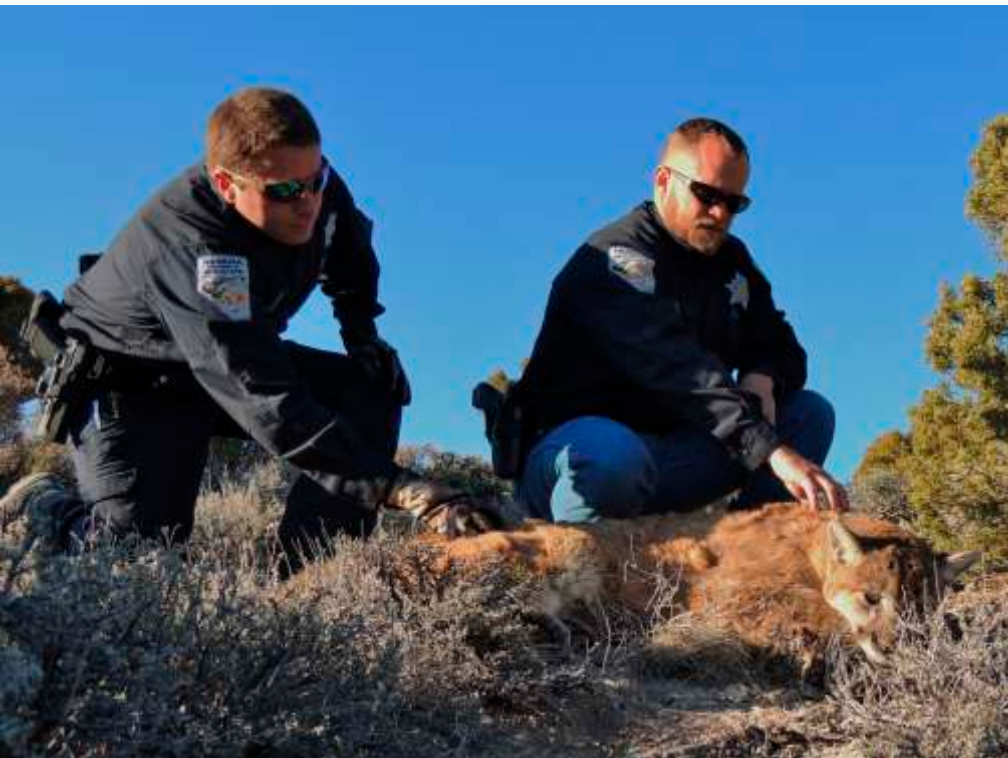
Nevada State Game Wardens tranquilize and release a mountain lion accidentally caught in a trap.