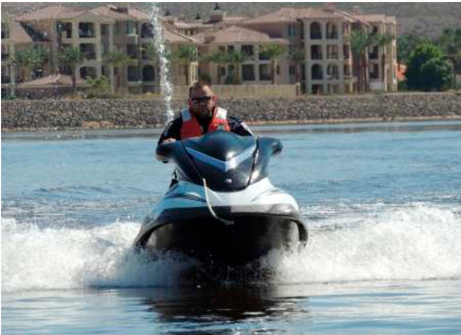
Nevada State Game Warden uses personal watercraft while doing patrols on the Colorado River.

accidents on record. We were hoping for a zero fatality year—an accomplishment we have not seen in 18 years—but we had an unexpected boating tragedy in December. Even though we didn't reach our goal of "absolute zero" boating deaths, we are encouraged by how much safer Nevada waters are becoming.