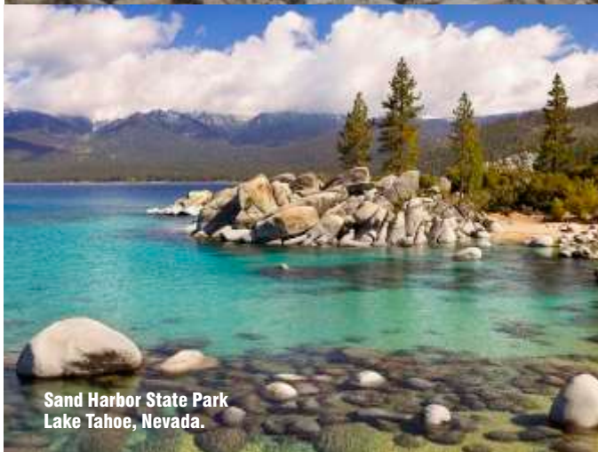
Sand Harbor State Park Lake Tahoe, Nevada.